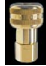
AUTOMATIC COMPLIES WITH A-A-59439