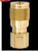
MANUAL SLEEVE GUARD